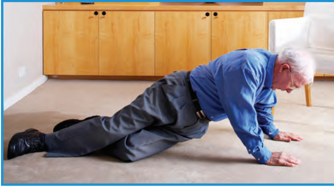
2. Crawl or drag yourself to a chair