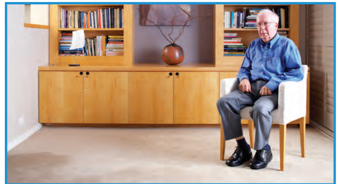
5. Rest for a while before standing up

If you can't bend your knees very well, slide along on your bottom then lift your hips onto something higher, such as stairs. Then you can pull yourself upright again.