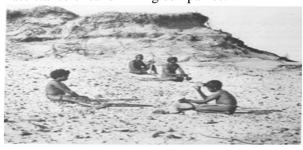
Aboriginal men & boys making tools for fishing & hunting on a typical North Coast Beach.