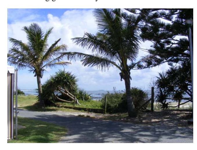
Pandanas Palms & Norfolk Island Trees along the walk

In 1956, avenues of three year old Norfolk Island pines and numerous coconut palms were planted by the Lions Club, Kingscliff Progress Association and local residents, to provide shade at the foreshore caravan park. These trees stretched from Marine Parade, Kingscliff North (formerly Wommin Bay) to the bowling green and beyond.